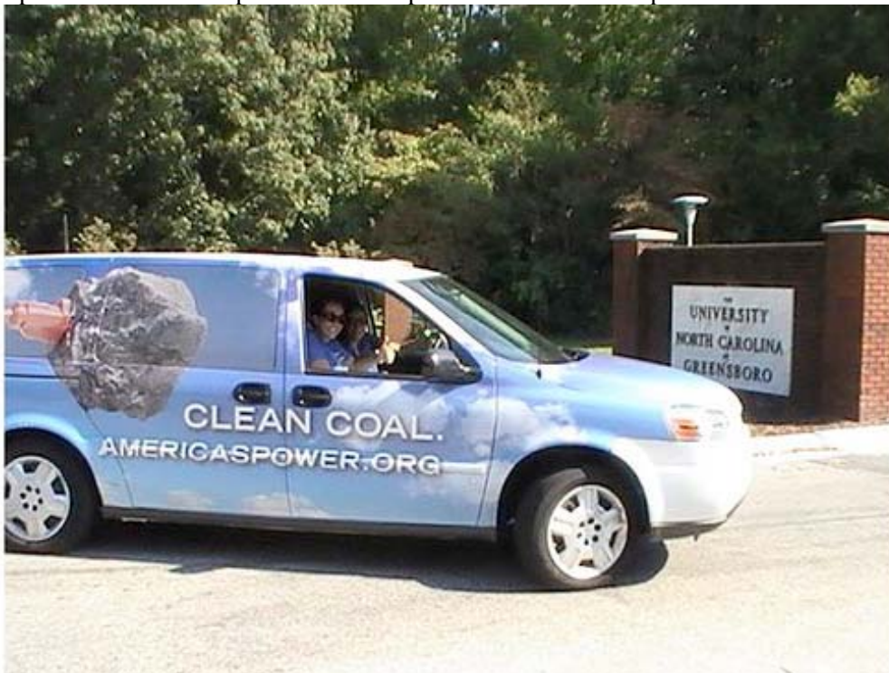
Mobile Clean Coal advertising in Greensboro, North Carolina

http://www.flickr.com/photos/americaspower/2821820393/in/pool-860503@N25